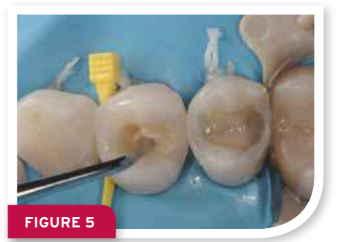
Composite is placed into the occlusal cavities using the plugger end of PFIDD3/4