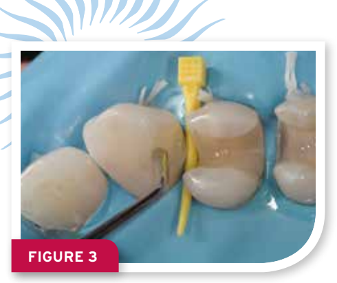
The plugger end of the PFIDD3/4 is utilized next to smooth the material

CompoSculp instruments were designed by Dr. Didier Dietschi with the intention of aiding clinicians in achieving superior esthetic restorations. The CompoSculp kit is comprised of 5 complimentary composite instruments for both anterior and posterior restorations.