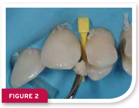
Rubber dam and a rubber dam clamp is placed to achieve proper isolation prior to removing defective restorations. The spatula end of the PFIDD3/4 is used to insert composite material in the distal cavity on the canine