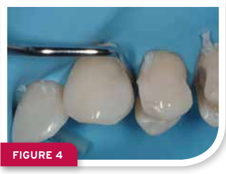
Proximal and distal contours are shaped and marginal ridges formed with the thin, sharp ends of PFIDD9/10